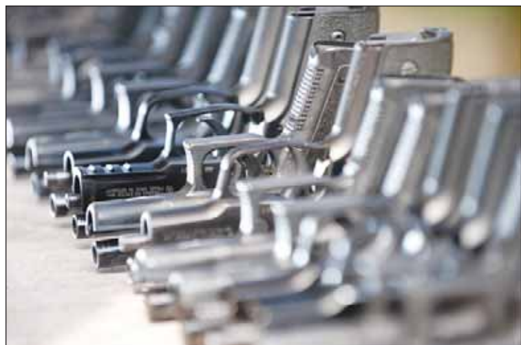
Above: the various handguns used by the recruits included a mixture of Glock’s and Sig Sauer’s depending on what their specific department used.

By now, the class of 04-09 is only a few weeks away from graduation. With the end in sight, some recruits experience a surge in energy even as fatigue threatens to over-take them.