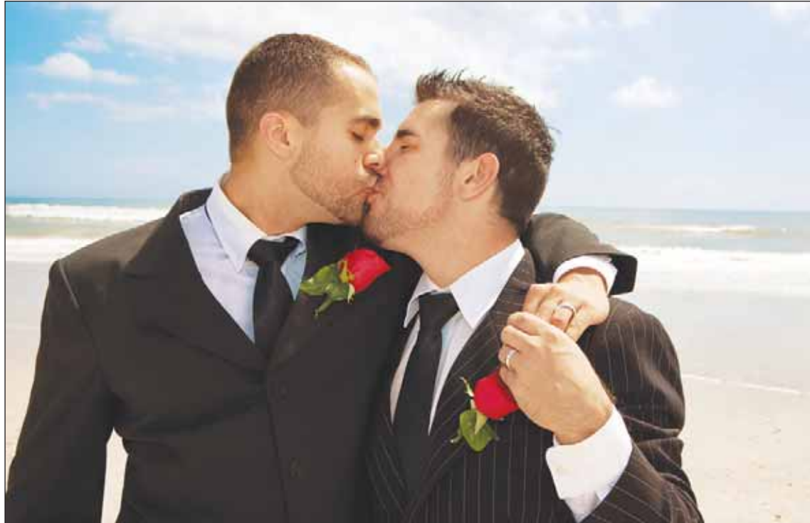
A wedding at the Jersey shore? Not for these two! They'll have to take their party plans to Iowa, Connecticut, Massachusetts, New Hampshire or Vermont.

Civil unions for same-sex couples are the compromise that many lawmakers, and