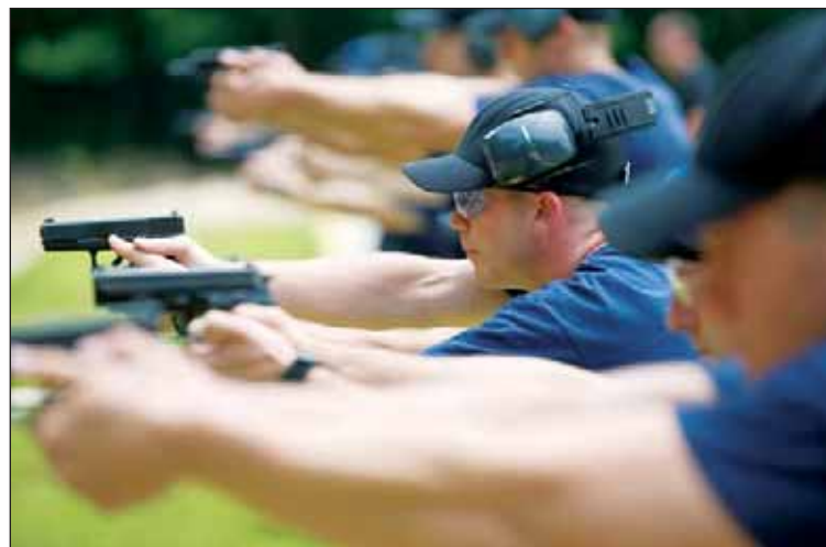
Firearms training continues for the recruits of Mercer County Police Academy class of 04-09, better known as “No Joke.”